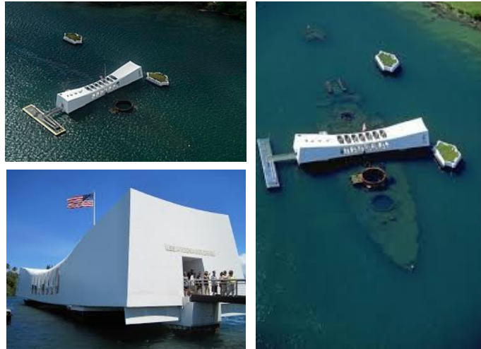
Pearl Harbor National Memorial